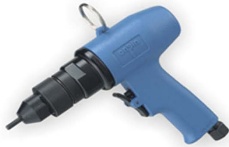
OP-PS5210 OP-PS5232 Handle exhaust The type of quick-changing 下排氣 快速更換形式